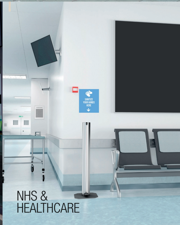
NHS & HEALTHCARE