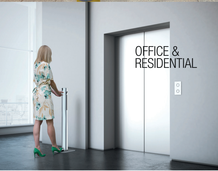
OFFICE & RESIDENTIAL