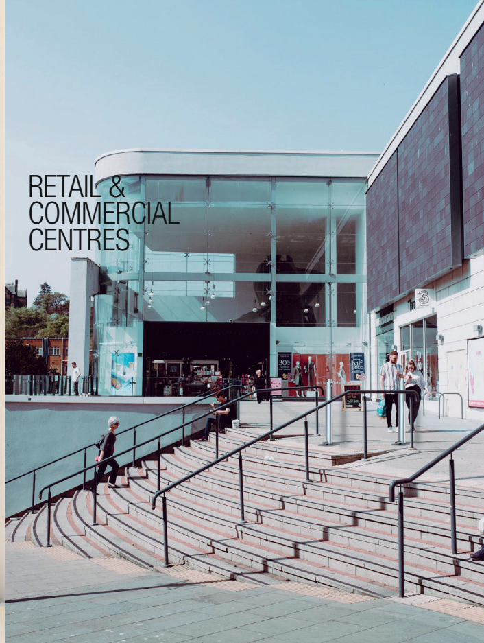
RETAIL & COMMERCIAL CENTRES